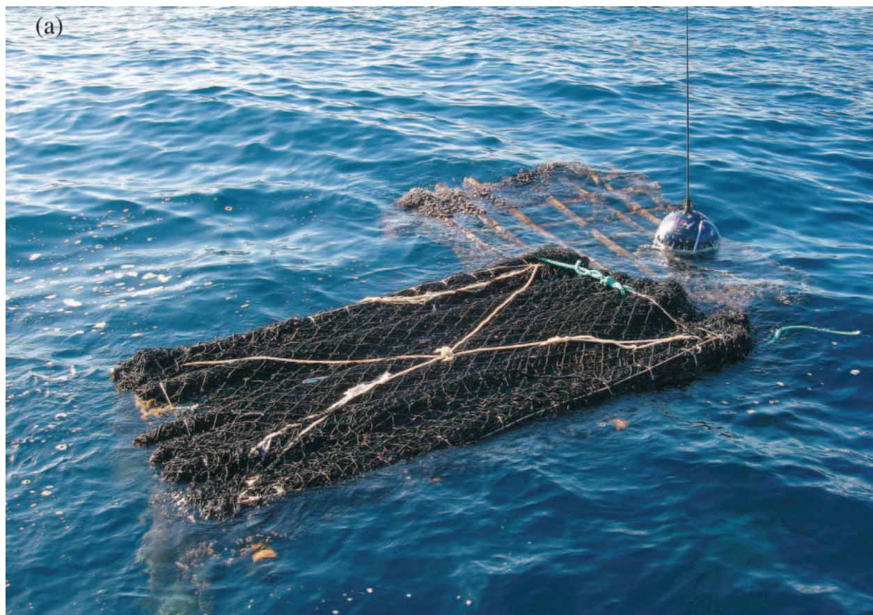
Fig. 1. Pictures of artificial drifting fish aggregating devices (DFADs) in the Indian Ocean and global positioning system (GPS) tracking radio buoy: (a) surface view (©Fadio/IRD-IFREMER/G. Moreno); (b) subsurface view (©Fadio/IRD-IFREMER/M. Taquet).