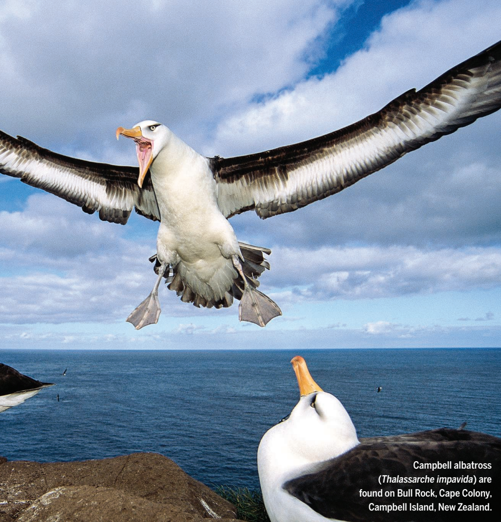
Campbell albatross ( Thalassarche impavida ) are found on Bull Rock, Cape Colony, Campbell Island, New Zealand.

on the high seas, will continue to protect biodiversity under climate change scenarios (4); others suggest that current MPAs will be ineffective, particularly in tropical and temperate regions (11), reflecting substantial uncertainty around the nuances of how species are responding to climate change. As species and habitats shift across space and time, mMPAs could be used to protect dynamic oceanographic habitats critical for ecosystem function, such as fronts, currents, or eddies, or to protect individual species or groups of species. mMPAs can further serve to protect connectivity corridors between static MPAs and thereby help to “future-proof” such MPAs against shifts due to climate change by offering protection when key species or habitats shift outside static boundaries. Dynamic habitats have already been described on the high seas through the Convention on Biological Diversity’s (CBD) Ecologically and Biologically Significant Area process (12) (see the figure and the supplementary table). Initiatives such as the Migratory Connectivity Project (MiCO) of marine species can be built upon to track the movement of species across their ranges and jurisdictional boundaries (13). Like traditional MPAs, mMPAs could be managed to protect species and habitats from mul-